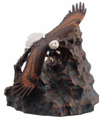
Eagle in Flight